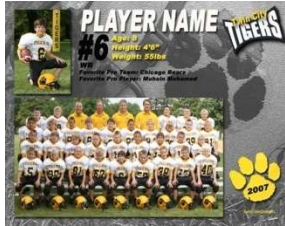
8x10 player/team composite

COACH , please indicate PICTURE DAY ___/___ and TIME ___:___ PARENTS , Please pay this day, with cash / check to Twin Cities Smile