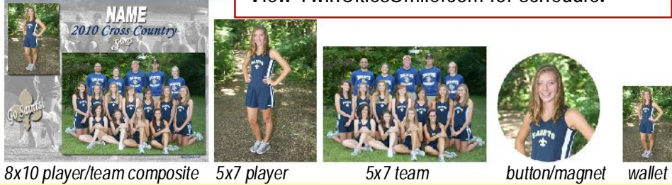
8x10 player/team composite 5x7 player 5x7 team button/magnet wallet

Order portraits on picture day. View TwinCitiesSmile.com for schedule.