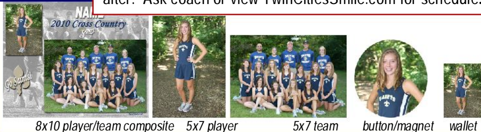
8x10 player/team composite 5x7 player 5x7 team button/magnet wallet

Order portraits on picture day. Late fee applies to those received after. Ask coach or view TwinCitiesSmile.com for schedule.